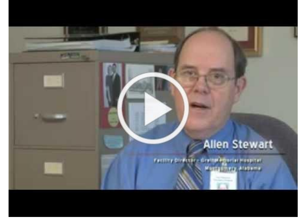
ESPC Greil Hospital, Alabama Case Study