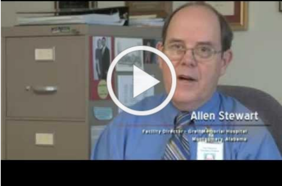
ESPC Greil Hospital, Alabama Case Study