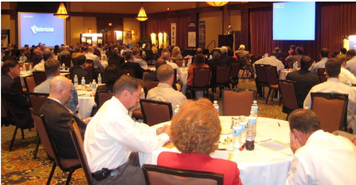
Attendees at an Alabama ESC Chapter Workshop 2010.